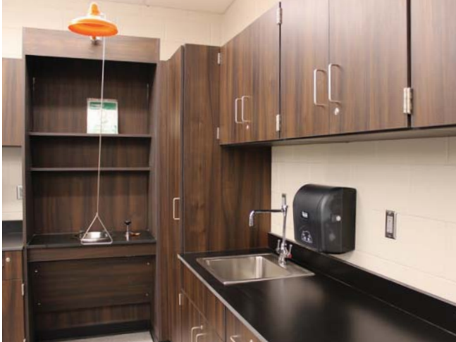
JACKSON CENTER PK-8 SCHOOL Jackson Center, Ohio

Architect: Freytag & Associates, Inc. Construction Manager: Peterson Construction Company Contractor: EZKin Company Stevens Dealer: Farnham Equipment Company Millwork Scope of Work: Reception Desks, Circulation Desk Wall Surround Assemblies Install Date: 2017