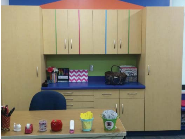
ST. JOSEPH CATHOLIC SCHOOL Olney, Illinois

Casework Series: 4400 A-tech Architect: BLDD Architects, Inc. General Contractor: K. Wohlman Construction Co. Stevens Direct Install Date: 2016