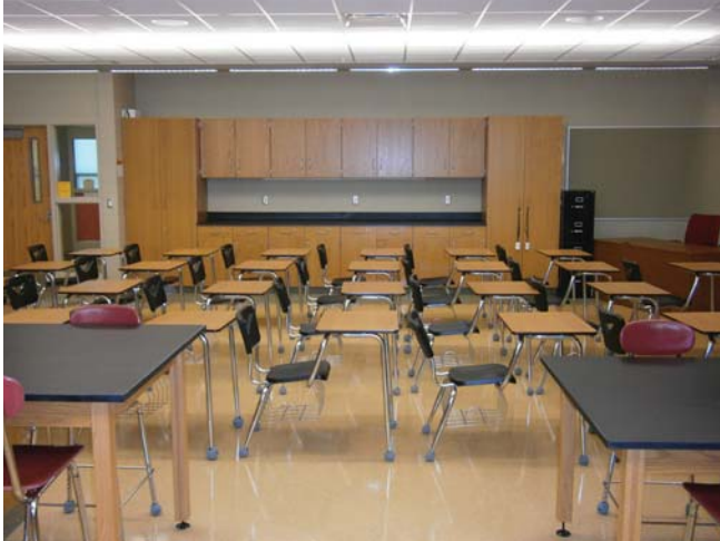
BRIMFIELD HIGH SCHOOL Brimfield, Illinois

Casework Series: 4700 Wood Veneer - Oak Stevens Direct